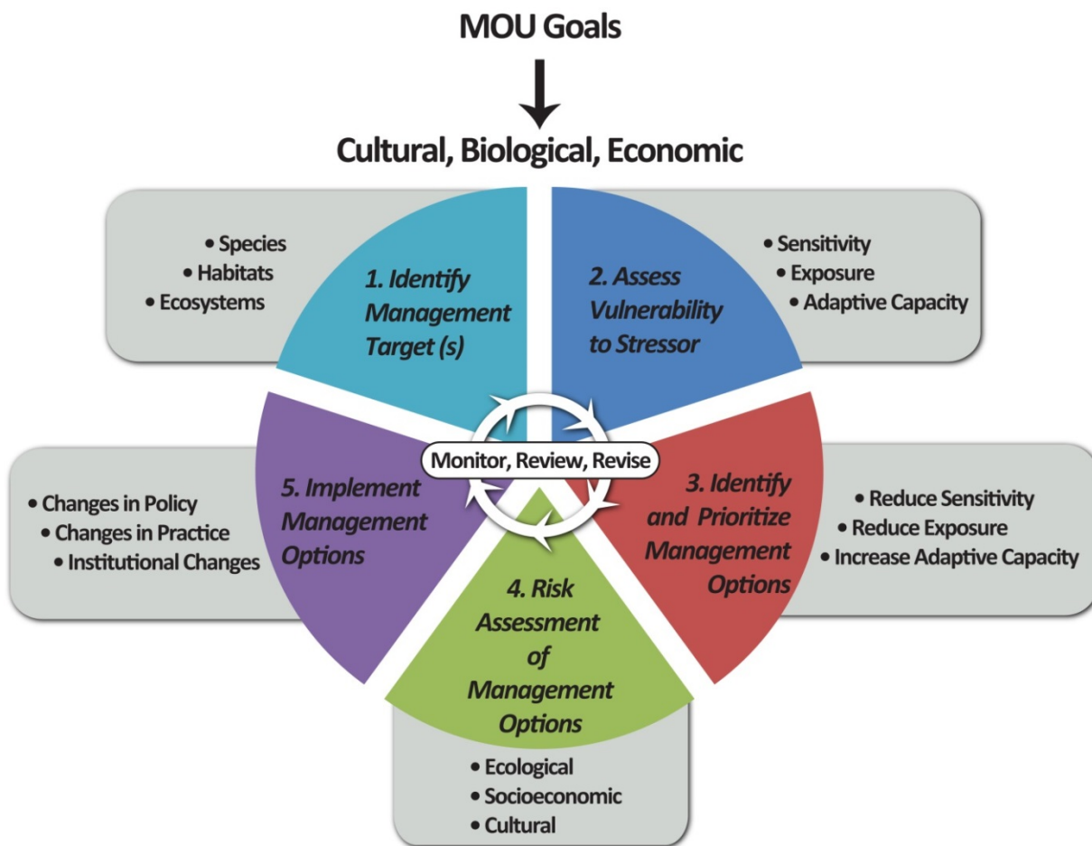
FIGURE 1: FRAMEWORK FOR AQUATIC ADAPTATION TO CLIMATE CHANGE FOR THE TRANSBOUNDARY FLATHEAD UNDER THE BC-MT MEMORANDUM OF UNDERSTANDING AND ENVIRONMENTAL COOPERATION